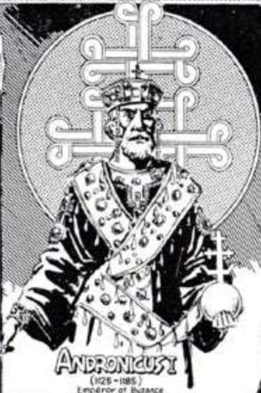
ANDRONICUS (1125-1185) Emperor of Byzance

PUT TO DEATH 22,000 MEN WHOSE NAMES BEGAN WITH THE LETTERS 'IS' TO THWART A PROPHECY THAT SOMEONE SO NAMED WOULD DEPOSE HIM