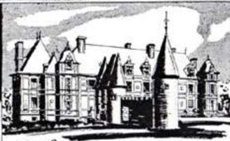
THE CASTLE OF KEROSIEN - Quimper, France WAS WON IN A SINGLE GAME OF CARDS / (1860)