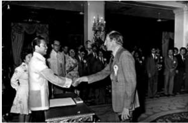
Meeting President Marcos of the Philippines during Southeastern Asian Games 1975-76.