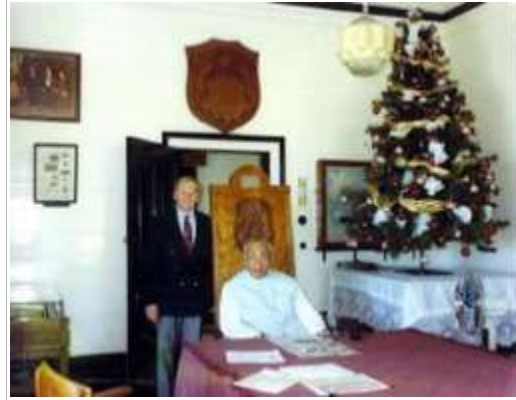
Meeting with King of Tonga Nuku'alofa Palace in 1991.