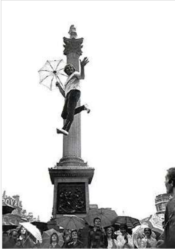
Performing in Trafalgar Square. London, England.