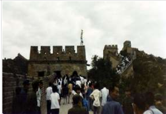
Doing a handstand on the Great Wall since there was no trampoline available! China.