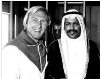
Meeting with and performing for King Hamad bin Isa al-Khalifa. Bahrain - 1977.