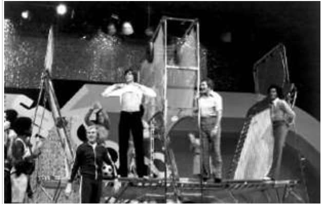
Performing on the "Mike Douglas" show with the "Jackson Five" & John Davidson in 1974.